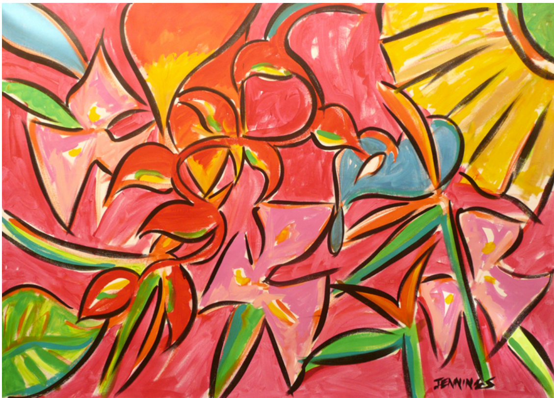
Still Life Study #58